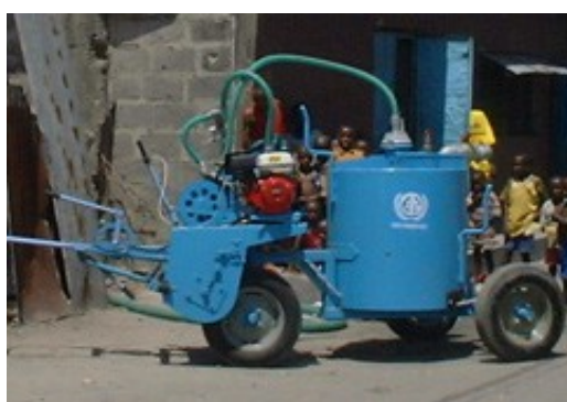
Figure 4 – UN-HABITAT Vacutug

During the 1990s there have been a series of machines designed specifically for densely populated urban areas where access poses a problem. The most accessible of these technologies is the UN-HABITAT/Manus Coffey and Associates Ltd developed Vacutug machine (figure 4). Other technologies have been used, but they are less directly available; they include (i) the Manquineta (WaterAid/MSF machine) used in Mozambique, and (ii)