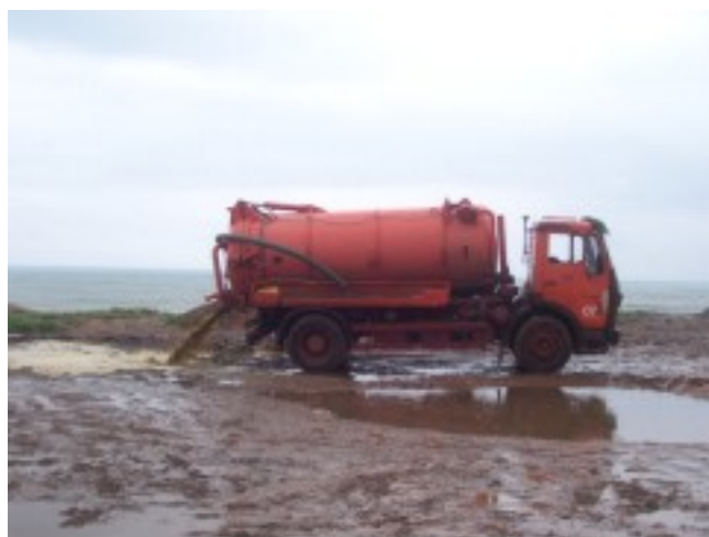
Figure 6 – A vacuum tanker discharges its load in Accra, Ghana

The use of such technologies has exhibited a low cost to customers, but only when considered on a unit cost basis. Due to the speed with which a tanker can exhaust a pit, despite its higher cost, it often costs less per