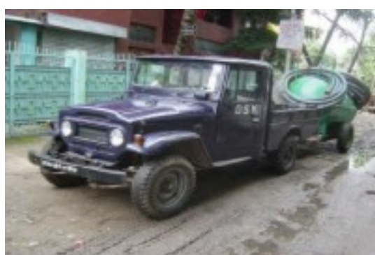
Figure 5 – Vacutug Mk II mother tank

Vacutug Mk II (figure 5), trialled in Dhaka, Bangladesh. The Vacutug project is still awaiting the scaling up phase. Currently a number of machines are