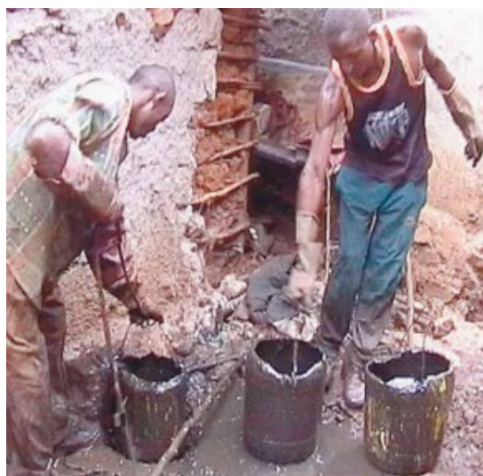
Figure 2 – Manual emptiers operating in Kibera, Nairobi

In many urban areas of the world manual emptying methods dominate the sector. Manual emptying occurs most frequently where large vacuum tankers are unable to access sanitation facilities. It is also generally the cheapest way of removing enough waste to keep a pit operational, although it is usually the most expensive per unit volume.