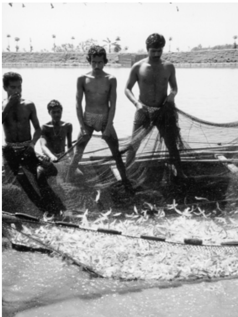
Figure 10.3 Harvesting Indian major carp at the Calcutta East wastewater-fed fishponds.

wastewater-fed fishponds in Calcutta East were managed in this improved way, they could supply nearly 50% of the local demand for fish).