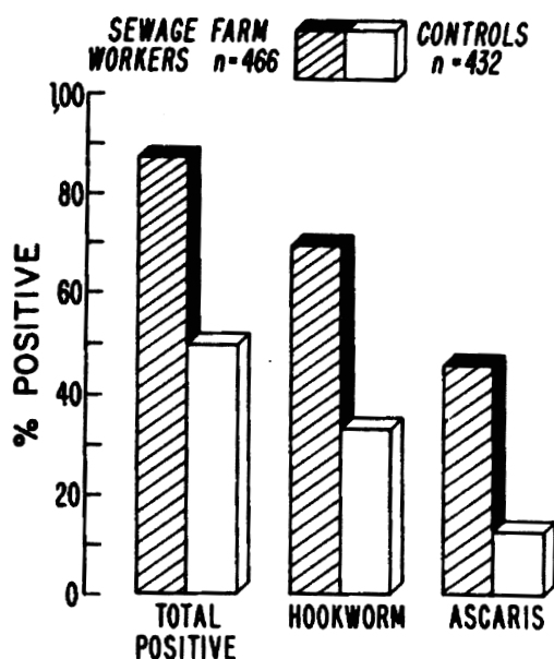
Figure 10.1 Prevalences of ascariasis and hookworm infection in sewage farm workers and a control group in India (Krishnamoorthi et al. , 1973).